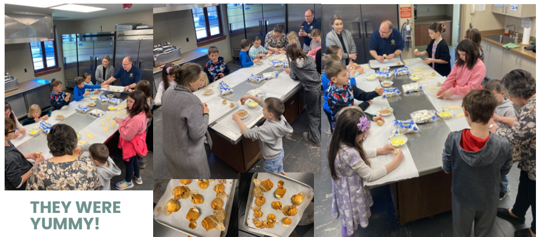
THEY WERE YUMMY!